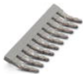
Insertion bridge, Number of positions: 10, Color: gray