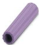
Insulating sleeve, Color: violet