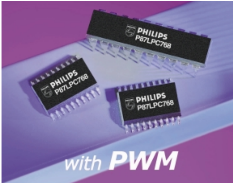
The P87LPC768 is available in 20-pin SOIC and PDIP packages